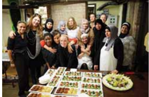
Hosted and catered a lavish Syrian banquet for Sofra Dayma, a gala fundraiser