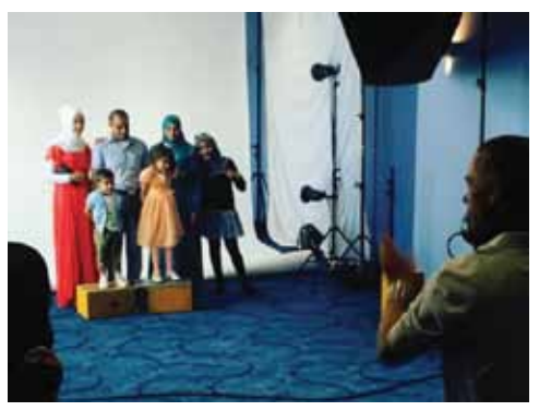
Acclaimed photographer Sandy Nicholson shoots family portraits at NK's party celebrating our successful $25k+ crowdfunding campaign