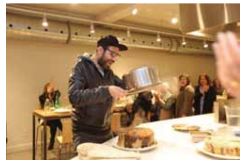
Co-hosted an interactive Dinner & Dialogue with HotDocs Documentary Film Festival for City of Ghosts, a film about citizen journalism in Syria

For all the amazing accomplishements of the last year, Newcomer Kitchen has yet to secure any sustainable funding to support our staff, operations and growth. Our small surplus will not last long; your support is still very much needed. Please visit us online to learn how you can help.