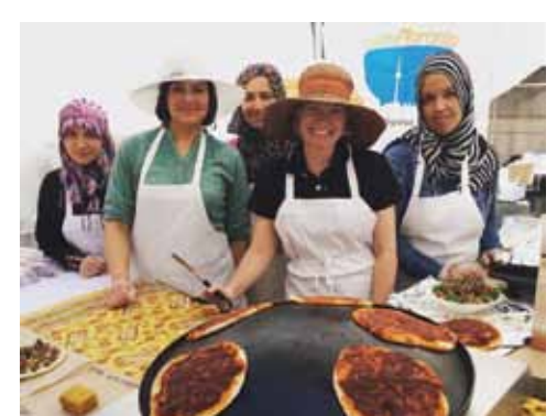
Prepared and sold 500+ food items at Luminato Festival — during Ramadan! and we'll be back this year with an Iftar dinner for 200+