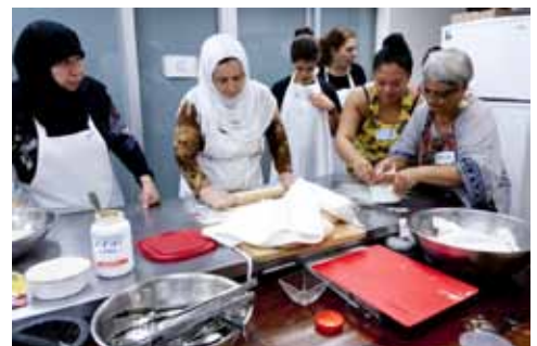
Held interactive workshops and catered 7 performances of Theatre Complicité's Like Mother, Like Daughter with Koffler Arts at the Gladstone Hotel, raising nearly $30k